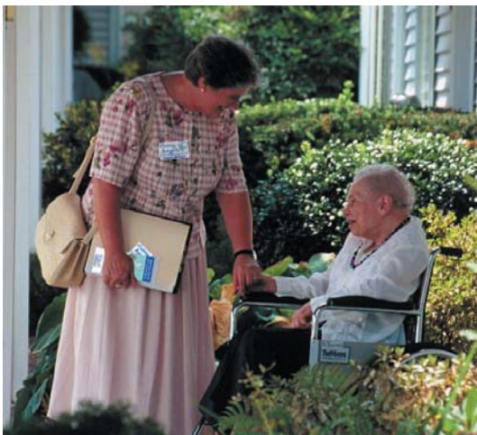
Making the home safer makes your life easier!